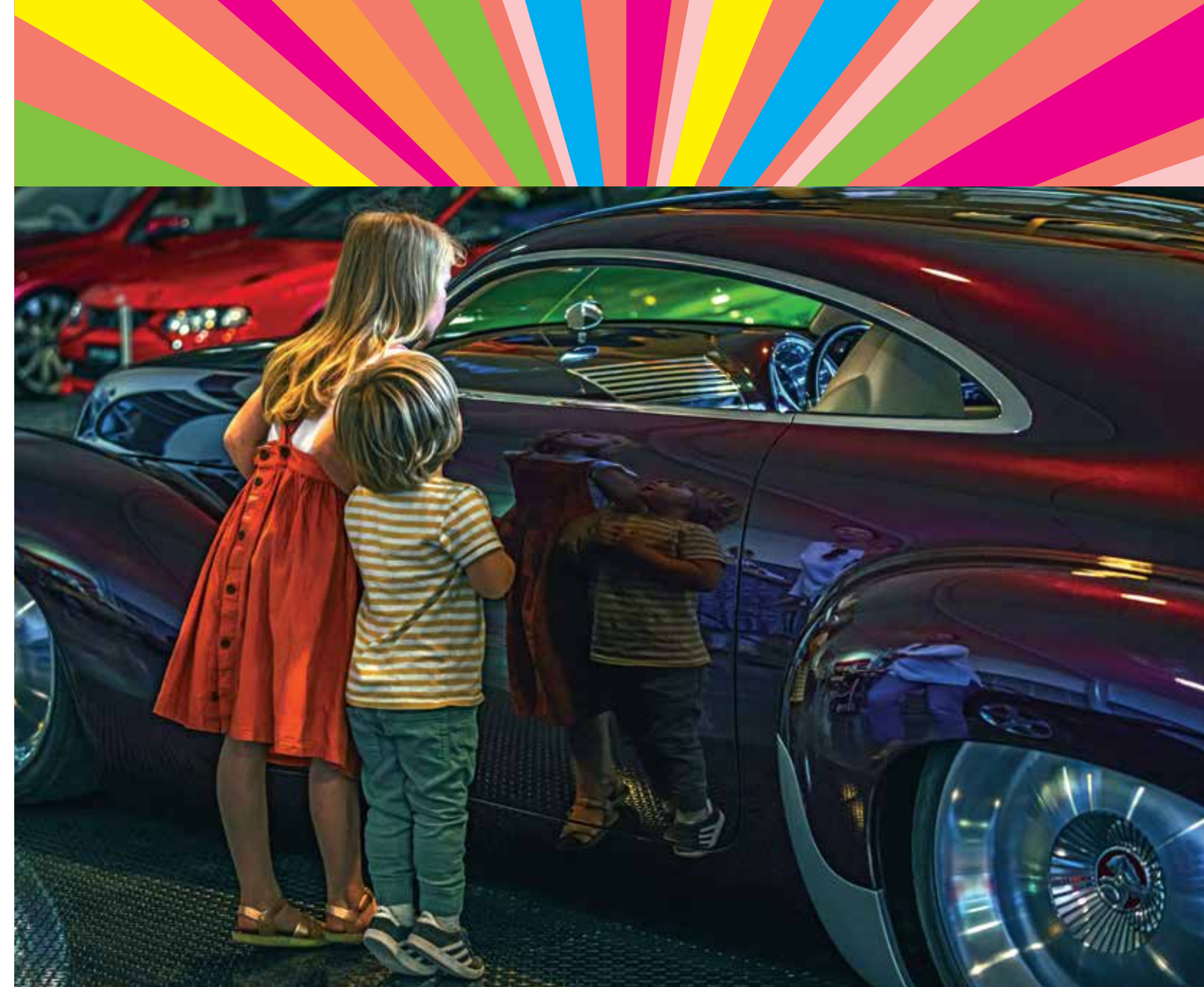
Above: Young National Motor Museum visitors enjoy the Holden Heroes exhibition at the National Motor Museum.