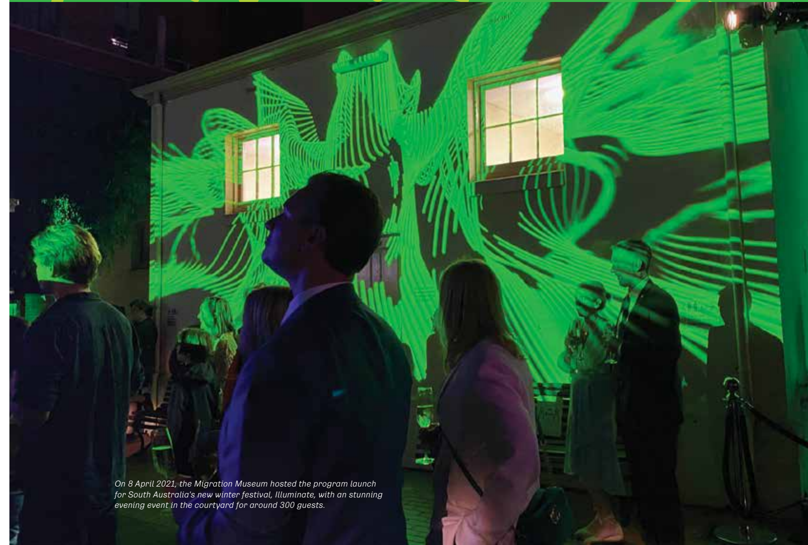
On 8 April 2021, the Migration Museum hosted the program launch for South Australia's new winter festival, Illuminate , with an stunning evening event in the courtyard for around 300 guests.

Conservation of the Migration Museum's heritage-listed buildings has been a major focus during the past year. Following the completion of a Conservation Management Plan, funds were received from the Department of Environment and Water's Government Owned Heritage Fund and the Department for Education for capital works to ensure the structural integrity of the main building. Once the works are completed, new long-term exhibitions will connect visitors with the history of South Australia in the nineteenth century in new and compelling ways.