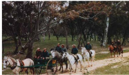
On the route to Adelaide from Castlemaine