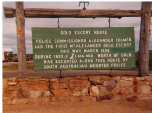
Along the route

Other rides in 1936 and 1961 confined themselves to sections of the route only. The 1978 ride from Bordertown to Wellington attracted an enthusiastic following culminating in a major 'Golden Gala Day' event organised by the Lower Murray Branch of the NTSA, which was held at the state and national heritage listed Wellington Police Station and Court House Complex. Crowds literally in their thousands welcomed the 'escort' in. The 1999 ride from Keith to Wellington was less celebrated and marketed, but nevertheless memorable.