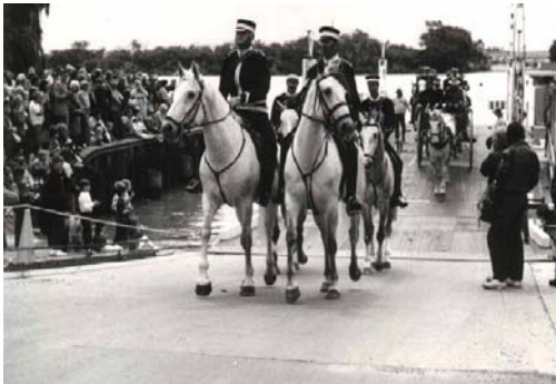
Crossing the River Murray at Wellington

Tracking south by south east on the way over, and north by north west on the way back, place names like Morning Star, (now Wistow) Potts at Langhorne Creek, Ferries McDonald (now a reserve) Mason's Lookout (Mason = Protector of Aborigines) Cooke's Station (Plains), Perkindoo, Hawks Nest, Kangaroo Flat, Chinaman's Hut, Tolmer's Rocks, Cold and Wet, Artimore, Binnies, McKinley's, Reedy and Limestone Wells, the 73 Mile Well, the 85 Mile Well, Mount Monster Station (now Keith) The Tatiara (the good country), Scott's Woolshed (now Bordertown), The Little Desert, Mount Arapiles, Kaniva, Polkemmet, Glenorchy, Navarre & Avoca. It's all still there.