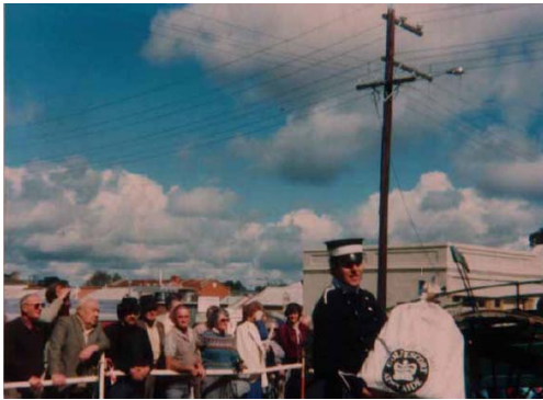
Receiving the gold for escort to Adelaide