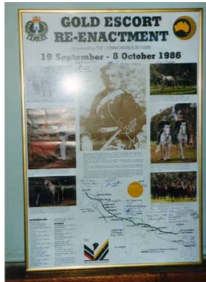
Poster for the re-enactment in 1986

For fifty years the National Trust of South Australia (NTSA) at head office, regional and branch levels has involved itself with remembering and re-enacting. Such fun has been enjoyed. Such pride has been felt. Unforgettable it must have been to be a passenger on board the paddle-steamer Marion in 1963 after the NTSA purchased it and had her old neglected wood burning steam engine fired up again for the evocative passage to dry dock at Mannum.