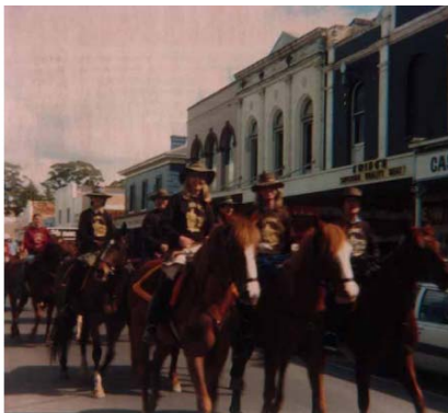
ATHRC departing Castlemaine 19 Sept. 1986

But among countless other successful re-enactments, it's the Gold Escort re-rides, and in particular the 1986 re-enactment ride from Castlemaine in Victoria to the original assay office in the old Treasury building in Victoria Square, Adelaide that remains so remembered by so many, locally, nationally and internationally.